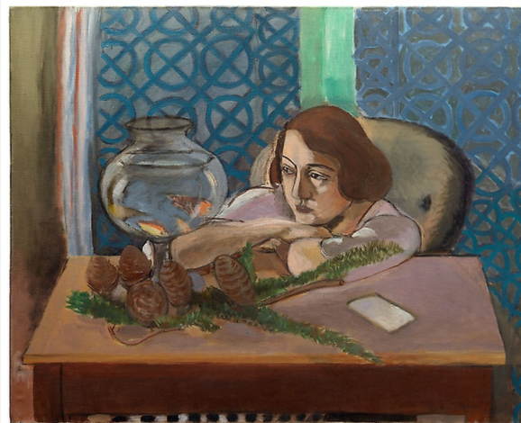
Woman before an Aquarium, Henri Matisse, 1921-23