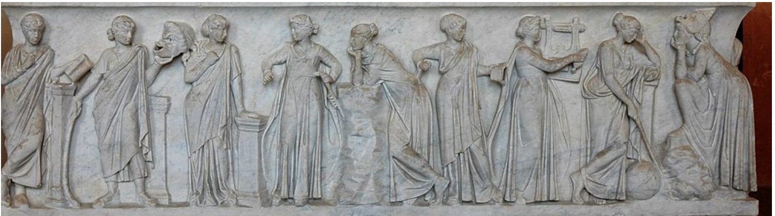
Roman Sarcophagus of the Muses, 2nd century AD; Louvre; Wikimedia; photo Jastrow, 2006.