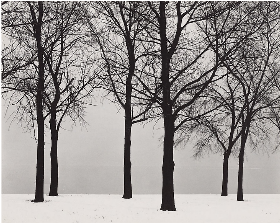
Chicago, 1950, Harry Callahan