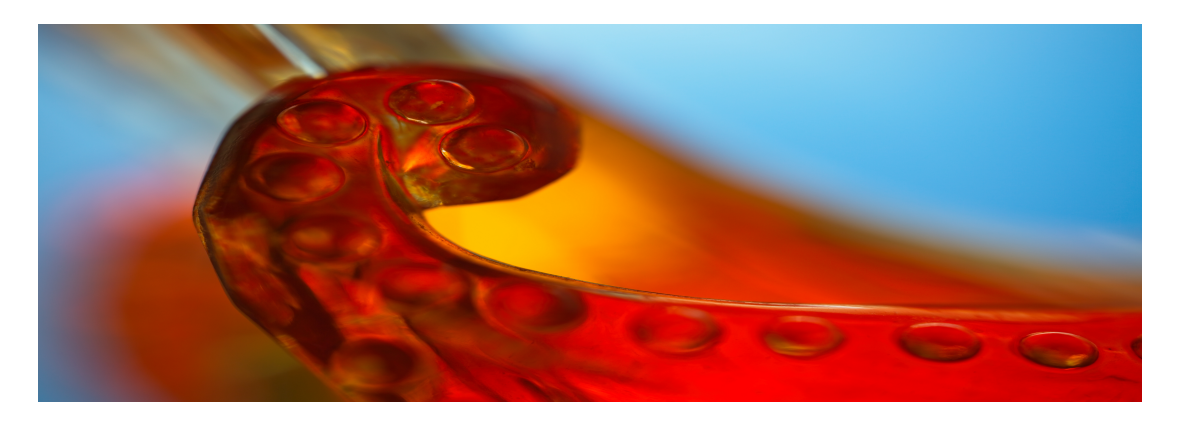
Rigatta, Brian Bemmels

The time, location and format for this meeting still has to be confirmed. We hope that it will be a hybrid meeting (in person at UBC + online using Zoom).