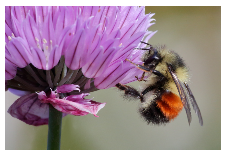
Black-tailed Bumble Bee