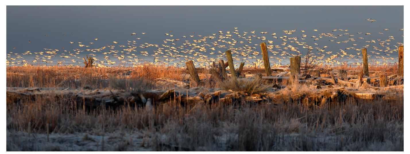
Snow Geese at Dawn, Brian Bemmels

COVID interrupted this activity, but it is probably worth restarting once COVID is over, since the students we contacted greatly enjoyed the opportunity to meet.