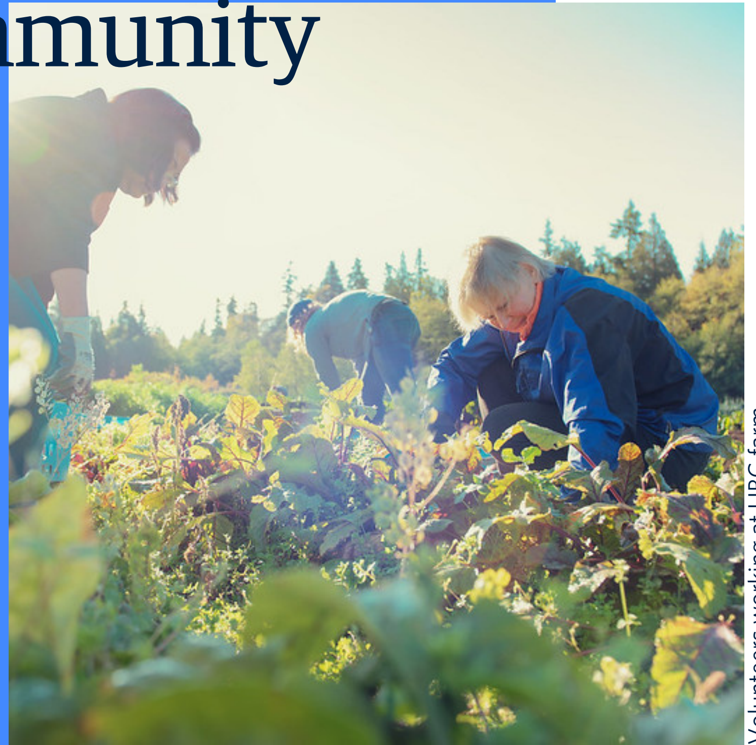
Volunteers working at UBC farm.

Almost all the groups we've heard from are looking for volunteers, given the severe shortage of volunteers in B.C. and throughout Canada. Several members of the Community Volunteer Group have already connected with the above organizations and are now volunteering in interesting and valuable outreach activities. Visit the College YouTube to watch past meetings .