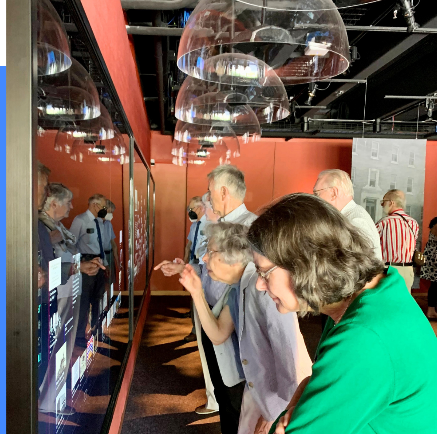
Above: Members of the College use the interactive wall at the Indian Residential School History and Dialogue Centre to explore the collection housed at the Centre.